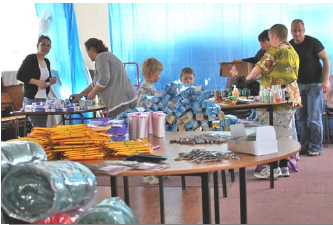
Left and below - The team in full flight, sorting and packing and stacking and having fun being Jesus' hands and feet.