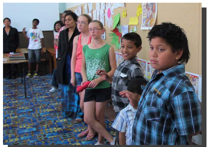
Above - Some more of the Pathfinders and their parents and supporters.