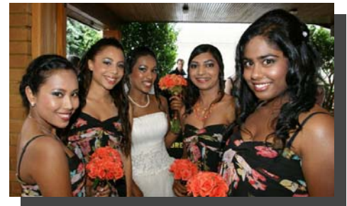
Right - The blushing bride and her attendant bridesmaids.